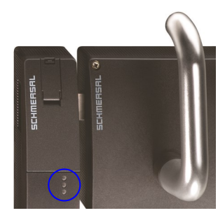
3 color LEDs for signaling: Green = Power; Yellow = Status Red = (Flashing) Diagnostic error